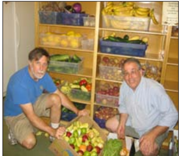
Willing Hands workers deliver a fresh load of colorful produce.

This fresh produce program is largely made possible by Willing Hands Enterprises, an organization that collects discarded and excess produce from retail grocers, farms, farm stands, and wholesale distributors, and distributes that food to needy recipients and service organizations throughout the Upper Valley. Sterns Produce, Cedar Mountain Farms, and many other local farms also generously donate produce to the Haven food shelf.