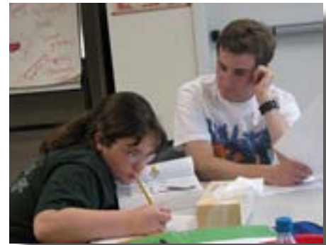
A former shelter guest working on her homework with a student volunteer.