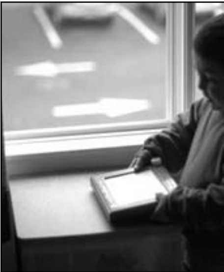
A young guest plays with his Etch-A-Sketch in his bedroom at the Haven.

~ A young couple with two children under two years of age. They had been living with relatives who had very poor housekeeping skills. The state child protective agency got involved when they learned of the poor conditions the children were living in. Both