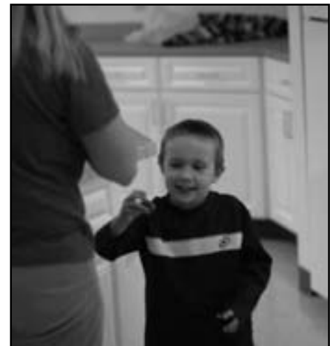
This young man gets a snack from his mother in the shelter kitchen.

They report it takes them 5-6 hours per day to take care of the animals, and their children adore living on a farm. What a great story!!